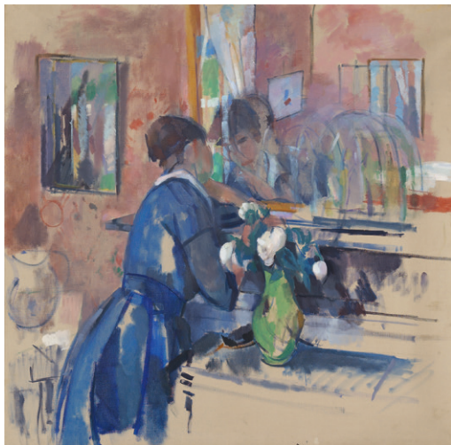
Rik Wouters, Dames en bleu devant une glace , 1914. MRBAB, Bruxelles

Icons from our collection of modern and contemporary art will be presented to you, in pairs or threes, in different parts of the Museum. They invite you to take part in sometimes surprising dialogues and to [re]discover them from another point of view.